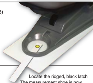
Locate the ridged, black latch The measurement shoe is now