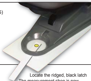
Locate the ridged, black latch The measurement shoe is now